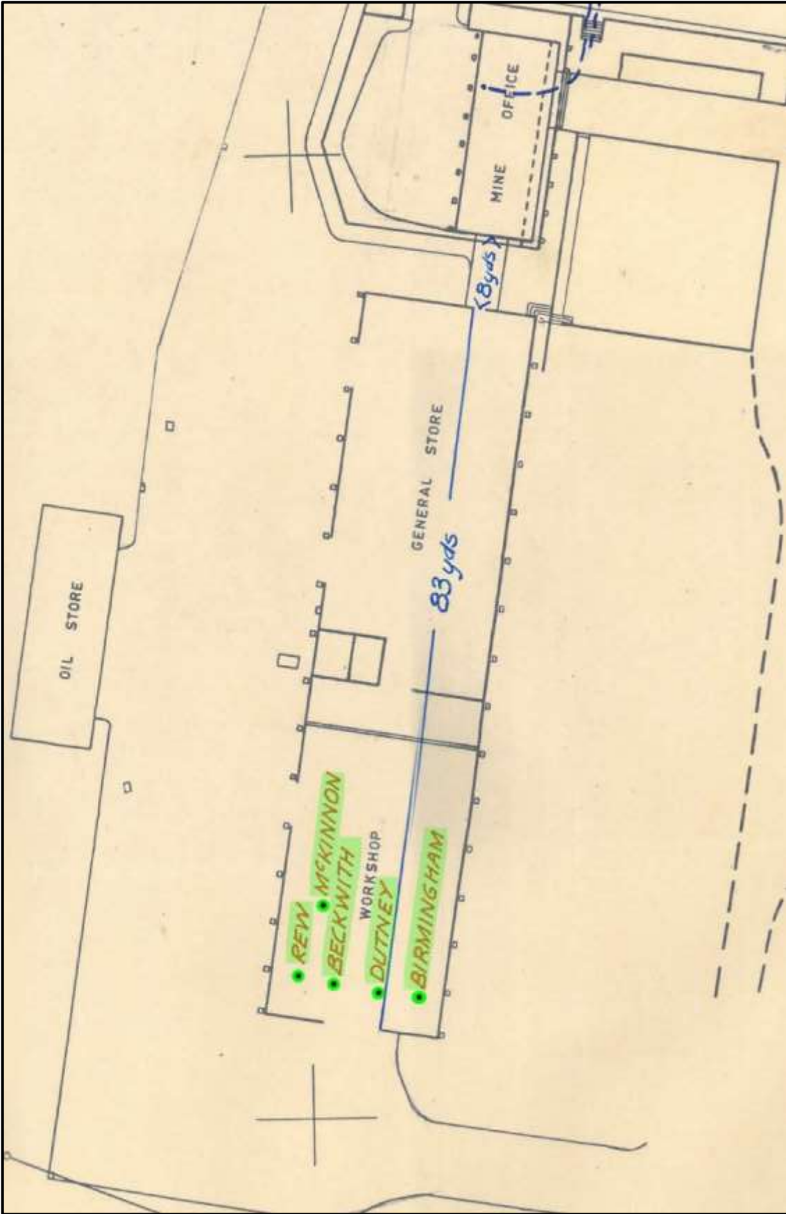
Workers in the workshop at the time of the explosion